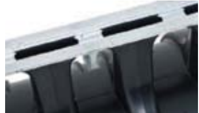
Q-Flow galv. steel high capacity tops