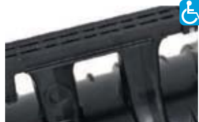
Q-Guard ductile iron ADA compliant tops