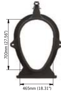
ACO Qmax 465