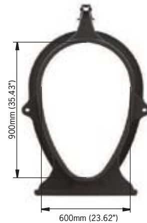
ACO Qmax 600