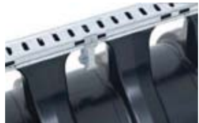
Q-Guard galv. steel tops

Choice of ADA compliant and high intake tops.